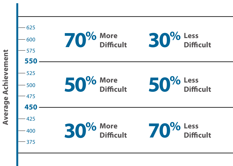
Exhibit 6: Test Form Assignment Plan for Higher, Middle, and Lower Performing Countries

Exhibit 6 illustrates the differential test form assignment plan for higher, middle, and lower performing countries. As a general objective, countries with expected higher average achievement scores, above 550 on the TIMSS mathematics and science achievement scales, would assign proportionally more of the more difficult forms (e.g., 70%) and fewer of the less difficult forms (30%). Countries with expected achievement scores between 450 and 550 would assign equal proportions of the more and less difficult forms. Countries with expected lower average achievement scores, below 450 on the TIMSS mathematics and science achievement scales, would assign proportionally fewer of the more difficult forms (30%) and more of the less difficult forms (70%).